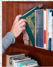
THE BOOK BEING LIFTED AND SWITCH ACTIVATED.