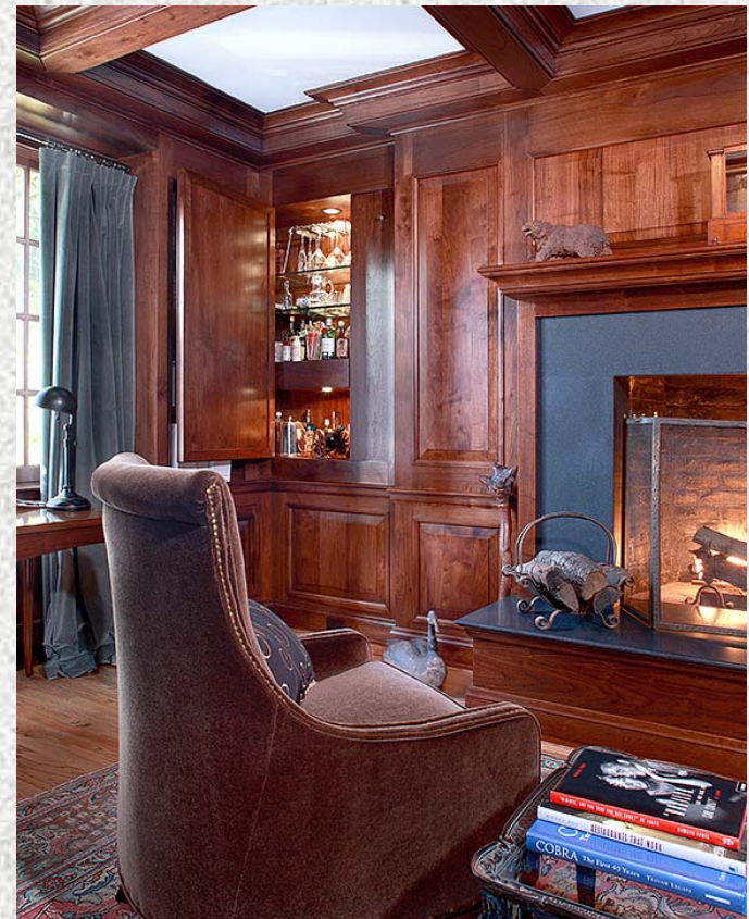
PANEL OPEN. A PLUNGER ACTIVATED BY THE SWITCH PUSHES THE PANEL DOOR OPEN.